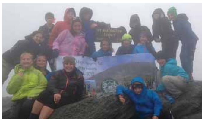
Whitefield Middle School volunteers at the summit of Mt. Washington.

All the funded trail and research projects entailed an educational component that made good use of hiker interactions in the field. To further the Fund's support of environmental education, specific grants were also awarded to organizations whose primary focus was education and outreach. The Whitefield (NH) Middle School's Wilderness Explorers Program's mission is 'To expose students and their families to the wilderness that exists in their own back yards.'