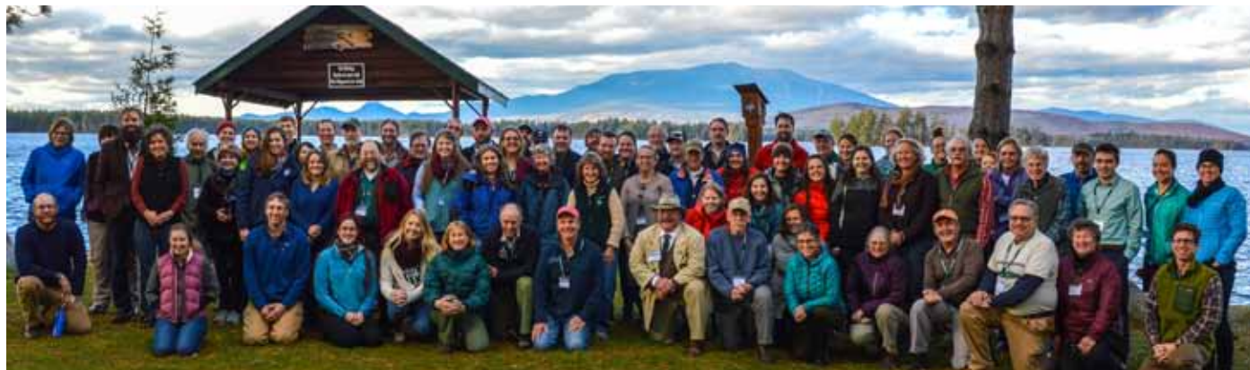
Smiling faces attest to the good time had by all at the recent Alpine Gathering at Baxter State Park in Maine.