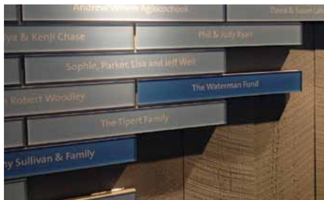
Donor names adorn the wall of the Extreme Mt. Washington exhibition.

Note: Grant applications for alpine project funding are due on December 15 . See the back cover for more information.