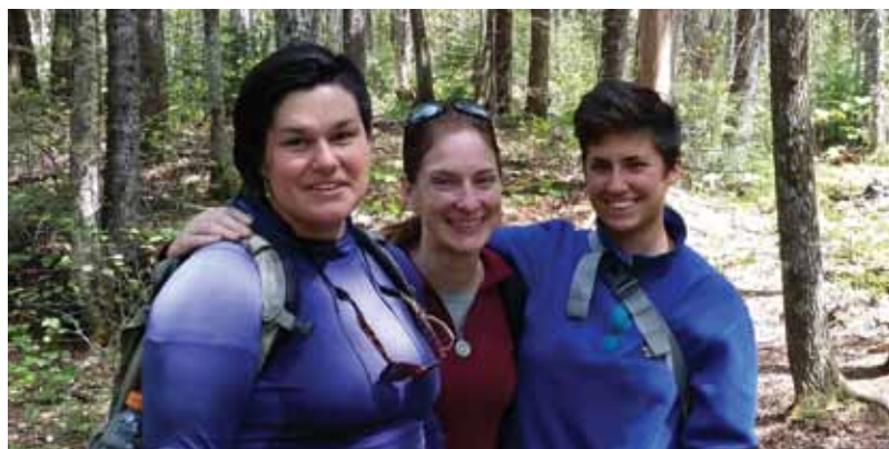
A group of Maine Appalachian Trail Club's caretakers.

The three year grant to the Mount Washington Observatory to support its exhibit 'Extreme Mount Washington: Be a Summit Steward' closed with the completion of the display and the opening of the exhibit in 2014. Visited by Waterman Fund board members and friends during our summer outing (see Laura Waterman's article, "Miracle of Survival in the Alpine Zone" on page 12) the exhibit consists of 20 alpine